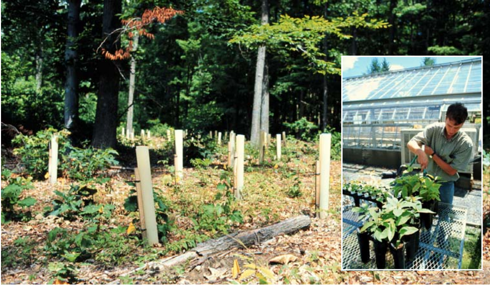
The research required to produce a blight resistant American chestnut is laborious, time consuming, and expensive. It involves both laboratory and field work and demands patience as trees are crossed, nuts are produced, and trees are grown and then evaluated for their resistance to the blight.

Further, the loss of this rich food source for wildlife was tragic. The nut-producing oaks and hickories that grew in the forests only partially filled the gap left by American Chestnut. Red maple often grew widely in place of American chestnut, but its value to wildlife is low.